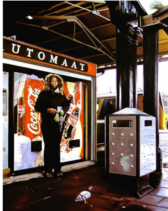
The Automat, acrylics on masonite, 37.6 x 27.6" or 93,3 x 70 cm, 2005