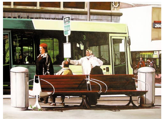
The Resemblance, acrylics on masonite, .32 x 48" or 122 x 91,5 cm, 2003

Either way, the cultural differences are there, but as human beings we still need the same things. In this case everybody wants to take the citybus, even the noses are pointing in the same direction for once.