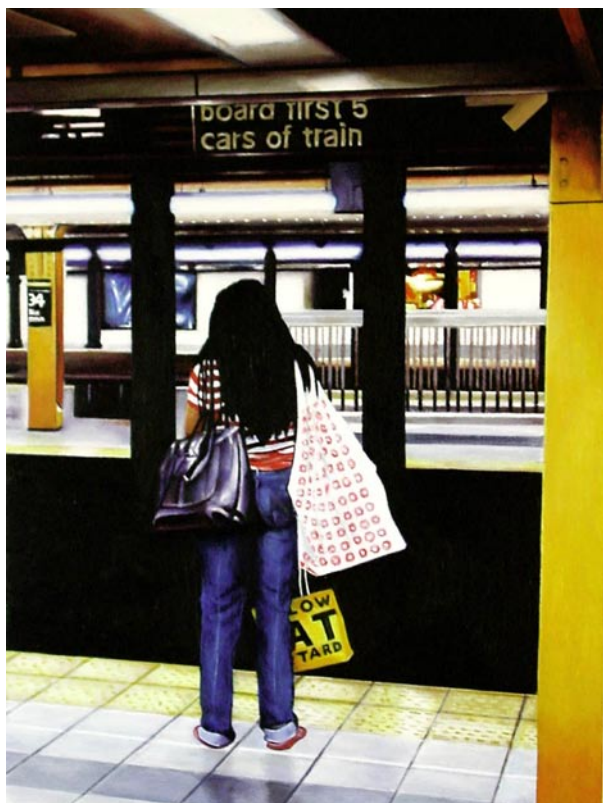
The Bags acrylics on masonite, 20 x 15" or 38 x 51 cm, 2006