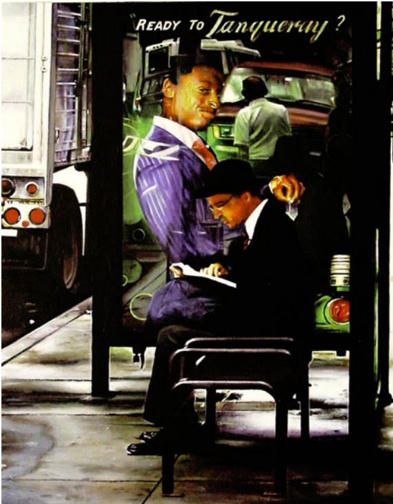
The Rest, acrylics on masonite, 23.6 x 17.7" or 60 x 45 cm, 2005, sold