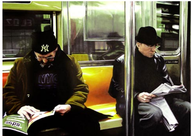
The Subway, acrylics on masonite, 37.6 x 27.6" or 93,3 x 70 cm, 2004, sold

Wissesdwinger 1, studio no. 15 8911 ER Leeuwarden, The Netherlands studio: 0031 (0) 58 2151276 mob: 0031 (0) 6 22477236 home: 0031 (0) 58 2895848 info@gerardboersma.nl