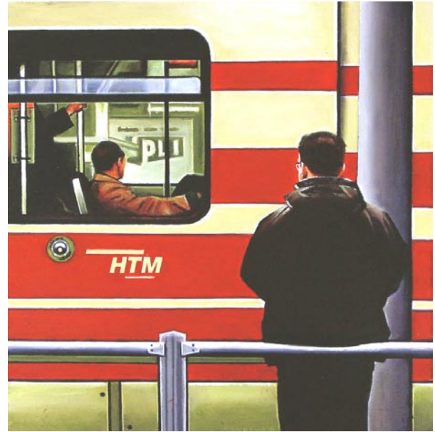
The Tram, acrylics on masonite, 13.8 x 12.6" or 35 x 32 cm, 2008

In The Hague you got these nice trams with red and some kind of light brownish yellow which I love to paint. Near central station I saw this man waiting for his tram to show up. The one right in front of him isn't his, or if it is he better hurry and get in. The scene reminds me of my museum paintings, because of the abstract background and the window. The window is almost like a painting within a painting, isn't it?