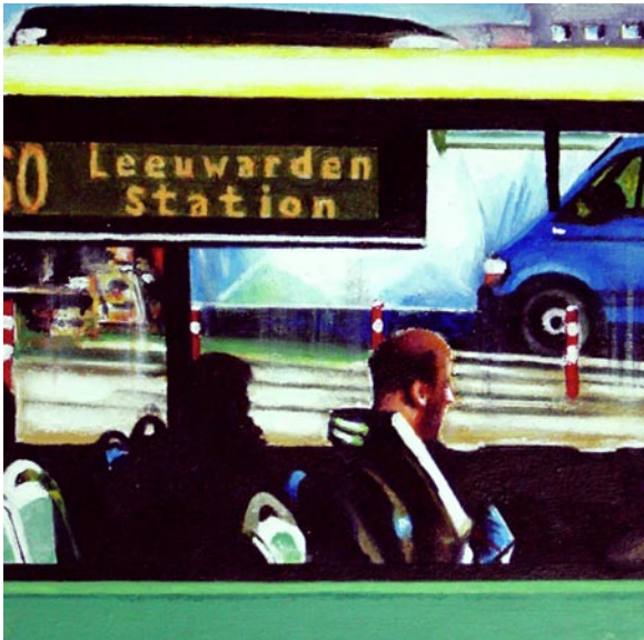
Connexxion, acrylics on masonite, 6 x 6" or 15 x 15 cm, 2008