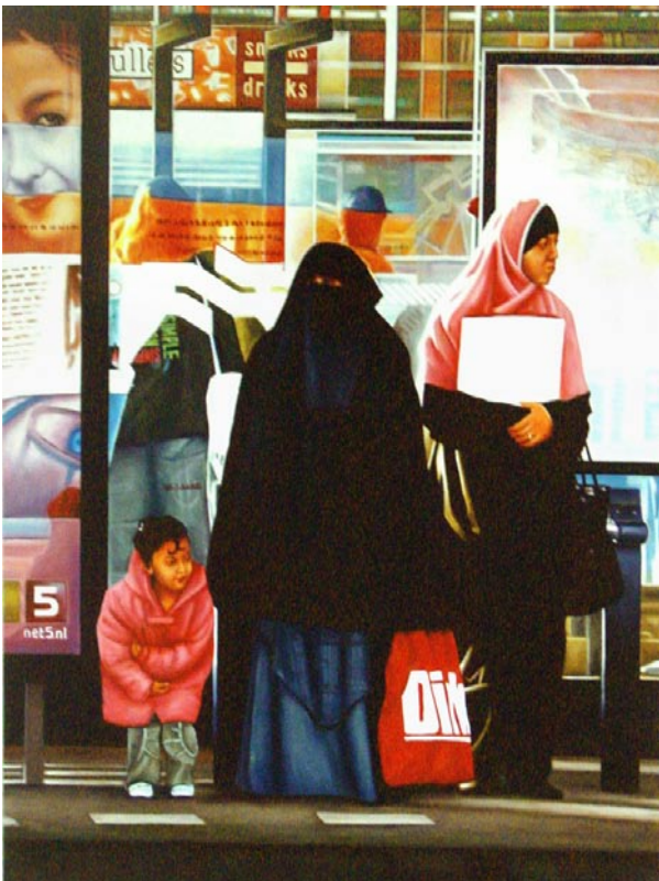
Dirk, acrylics on masonite, 35.6 x 27.6" or 90,3 x 70 cm, 2005

Anyway, she's holding a bag by a well known supermarket in the Netherlands called Dirk. It won't get more Dutch than that!